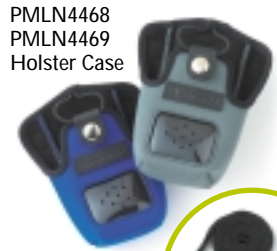
PMLN4468 PMLN4469 Holster Case